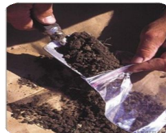
5. Place 1 cup of mix in plastic bag

Soil tests can be purchased from Michigan State University Extension. Go to https://www.canr.msu.edu/resources/soil_test_kit_self-mailer