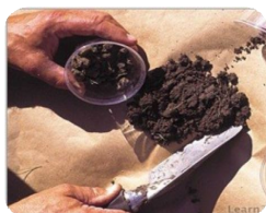
4. Combine samples and mix