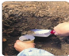
2. Collect Sample