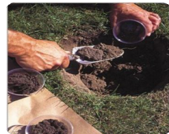
3. Sample Multiple Spots