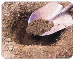
1. Dig 6 inches down